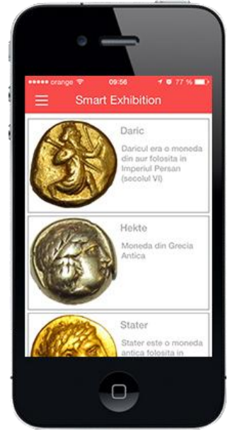
Fig. 3. Coins categories

In the Figure 3, the coins collections categories from the mobile application are presented.