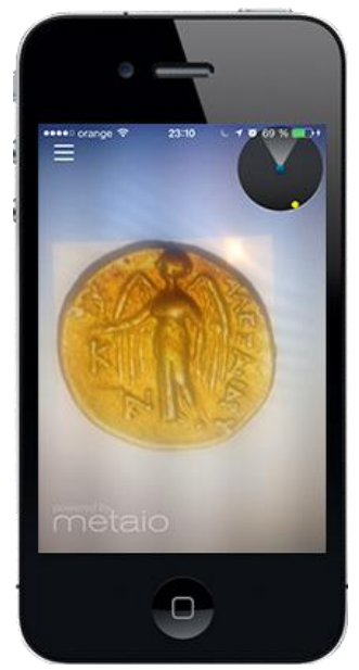
Fig. 8. Augmented reality

Figure 8 presents the augmented reality facility offered by the application.