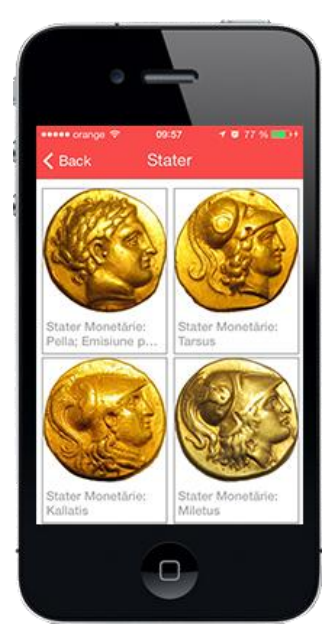
Fig. 4. List of coins in category "Stater"

this page to run automatically or manually, presenting an images gallery related to the selected currency. Also, this page shows relevant information about coin: creation date, size, description, and provider.