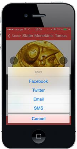
Fig. 7. Distributing content

Figure 7 shows the possibilities to distribute content from the mobile application, using social networks or personal information management facilities (email, SMS).