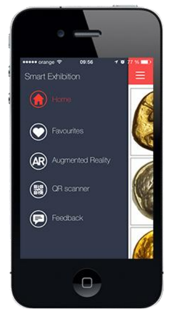
Fig. 2. Mobile application menu

These features are implemented and structured by menu-type "side-bar". The menu opens to the left of the screen and reveals five options: home , favorites. augmented reality, QR scanner, feedback. By choosing one of the options, the user will navigate to the corresponding page. Since the mobile application was developed using the storyboard model, the navigation between pages is done using the segue links.