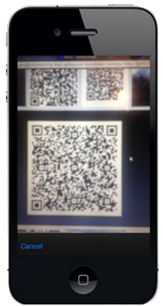
Fig. 9. Read QR codes

specialized references, documents, case studies. Through these codes descriptions of objects can be accessed easily, by simply avoiding user input errors (where the web is quite complex).