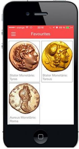
Fig. 6. The "Favorites" menu

In Figure 6, the "Favorites" page is presented, which contains the coins saved by the user.