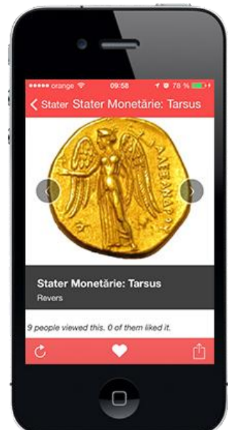
Fig. 5. Presentation of the selected object

Figure 5 shows the presentation view of the selected object from the list with coins in a category.